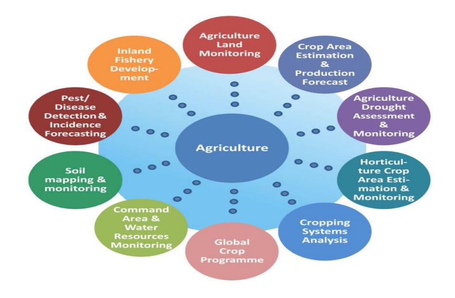
Figure 2: Remote Sensing Technology and Agriculture

production. Remote sensing technology is being used to forecast the production of crops and yield over a specific areas, which determines the quantity of crop harvested under different circumstances. It assist researchers to make a fair prediction about the quantity of crop. This technology can also be used to assess crop progress and timely precautions. It can exactly determine the amount of crop which has been damaged and the progress of the rest. It can also help in estimating acreage of farmland. It is very time taking and burdensome procedure if it is carried out manually because of size and other issues but remote sensing has make it more feasible. Remote sensing technology helps in identifying pests in farmland and plays a significant role in getting rid of the pests and diseases on the farm. Another important feature of this technology is that it provides data about the soil moisture. This information is then used to determine whether a particular soil is moisture deficient or not and helps in planning the irrigation needs of the soil. Moreover, soil mapping is one the most common yet most important uses of remote sensing technology. Remote sensing helps in the identification of soils which are not suitable for crops.